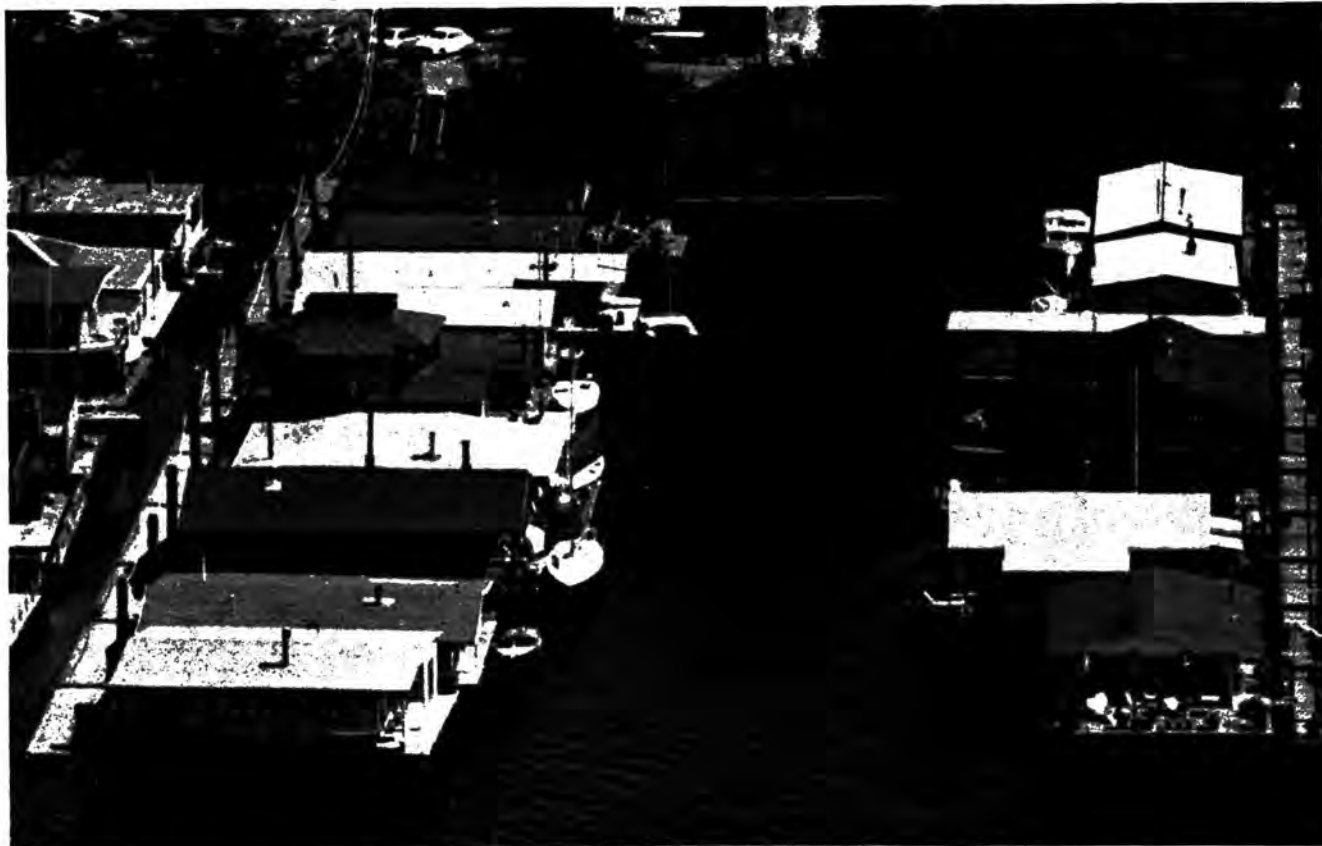
He Has a Reason